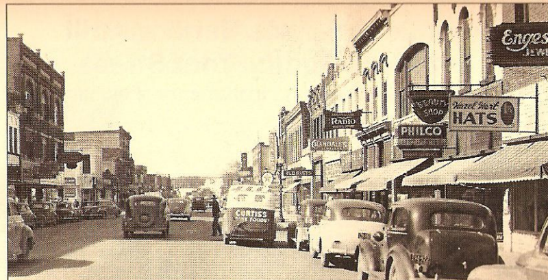
400 Block South Front Street looking South, 1950s